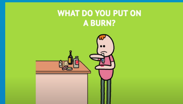
How NOT to treat a burn