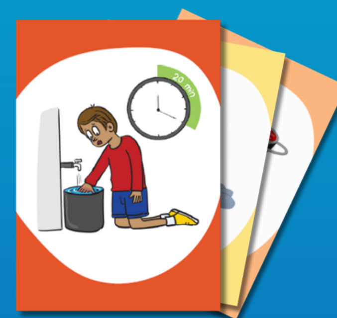
Burns Card Game