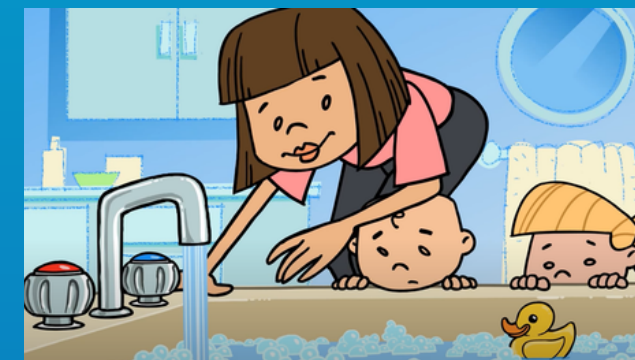
Preventing Burns and Scalds in Children