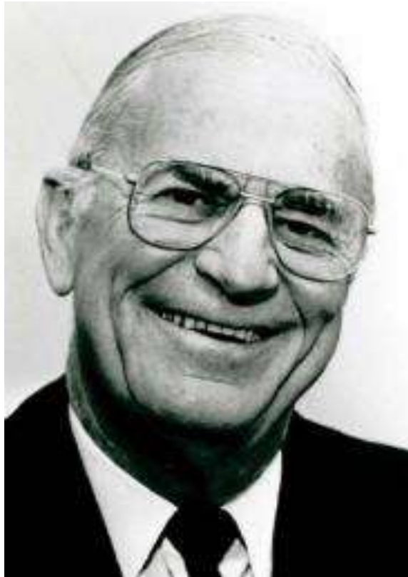
The Honourable Mr Justice Charles Leycester Devenish Meares, AC, CMG (1909 – 1994)