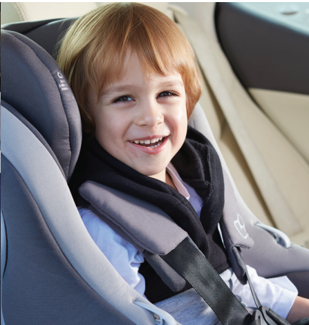
Forward Facing Child Car Restraint