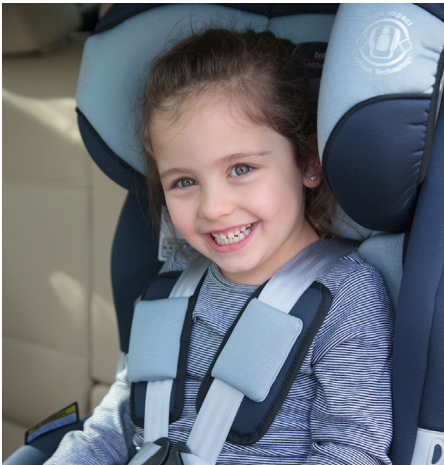
Child Car Restraint with Inbuilt Harness

Child car restraint models are now available with inbuilt harnesses to accommodate children up to approximately 8 years and booster seats that accommodate children up to approximately 10 years. When deciding whether your child is ready to sit on the vehicle seat do the “ five step test ”. See the “Child Restraint Guidelines” publication on the Kidsafe Australia website.