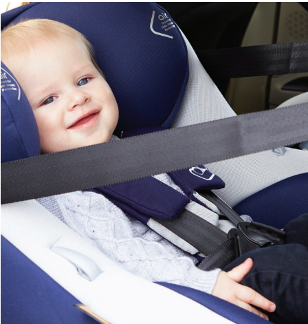
Rearward Facing Child Car Restraint

Keep your child in a child car restraint with an inbuilt harness until the child reaches the maximum size limit (height/weight) of the restraint. Extended rearward facing options are available on some convertible child car restraints which have the ability to take a child rearward facing up to 2-3 years (30 months) of age.