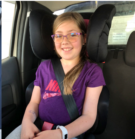
Booster Seat with Adult Seatbelt